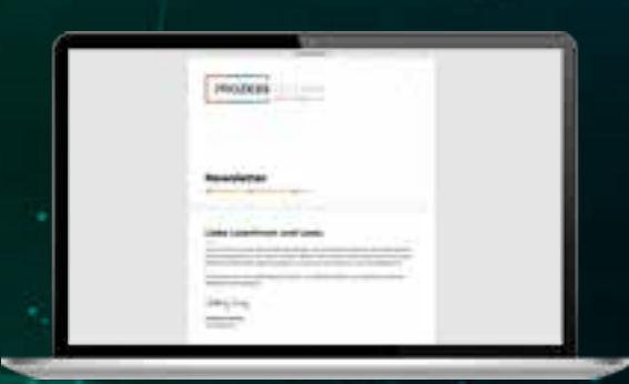
To the newsletter archive