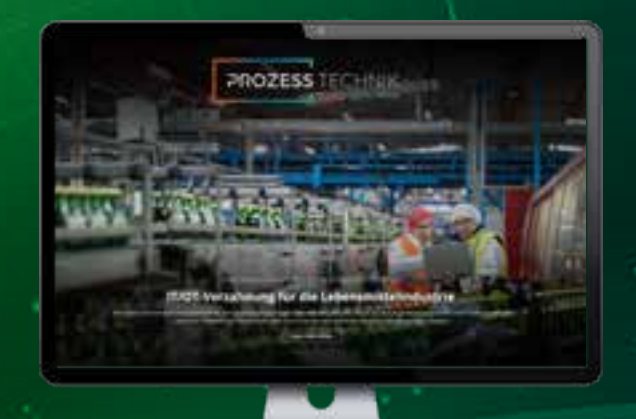
To the demo page

Innovative advertising formats and the presentation of product and company innovations achieve an unbeatable effect.